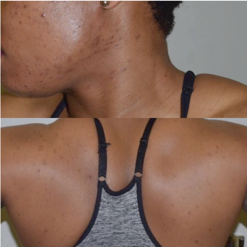
Figure 1. A 27-year-old female PIED user with acne on the face and trunk

Severe acne was noted mainly on the trunk with monomorphic lesions and comedones. She was generally healthy with no significant history of note. Drug enquiry was nonsignificant besides use of whey protein supplements. Physical examination revealed a well-built masculine female with no other androgenizing signs besides hypertrophic biceps, triceps and lower body muscles.